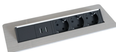
Open and close lid with a gentle touch.