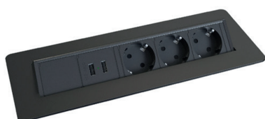
Available in black, white and brushed steel.

Ever increasing technical requirements call for more functional and convenient IT infrastructure in the office. Axessline QuickBox F300(W/B) provide a complete yet easily accessible solution with the simple push of a button. The product's spring mechanism automatically opens its cover to give instant access to a wide range of technical options.